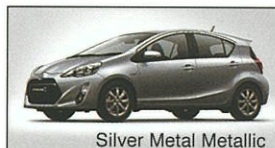
Silver Metal Metallic