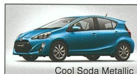
Cool Soda Metallic