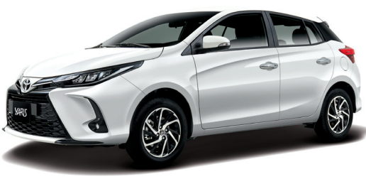
SUPER WHITE II