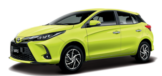
CITRUS MICA METALLIC