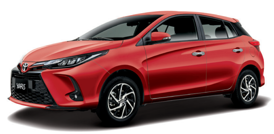
RED MICA METALLIC