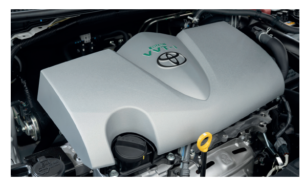
1.5L Engine* - The 1.5 Dual VVT-i Engine provides fuel efficiency at all engine speeds.