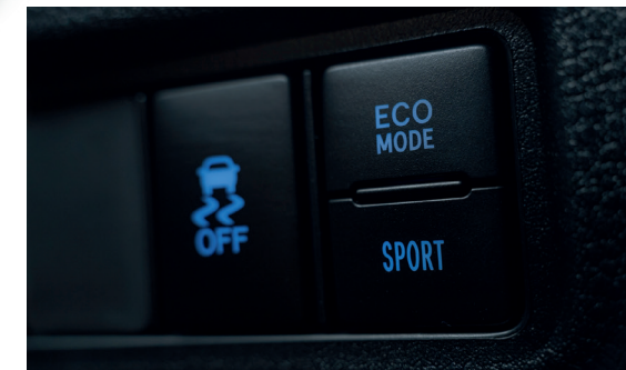
Eco and Sport Drive Mode* - The Toyota Yaris comes with Eco and Sport Mode for fuel efficiency and performance acceleration. Perfect for whatever driving mood you're in.