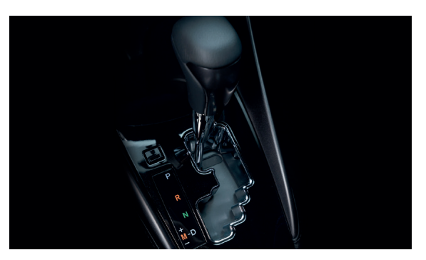
Continuous Variable Transmission (CVT) - Enjoy seamless shifts between gears with the Continuously Variable Transmission (CVT).