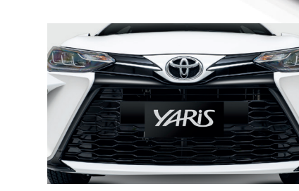
New Front Grille Design - The Yaris' sporty mesh type, new front grille will definitely get you all the attention on the road.