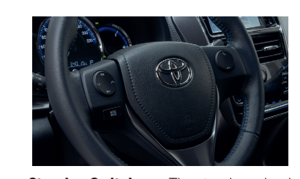
Steering Switches - The steering wheel in the new Yaris is designed for you to easily maneuver. It also has audio switches, so you can quickly turn the volume up or down.