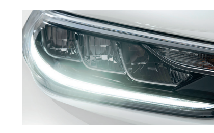
Daytime Running Lights* - Strikingly appealing upon sight, the Toyota Yaris' Daytime Running Lights also enhances safety with better visibility even in broad daylight.