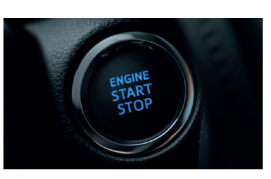
Push Start System* - With the Push-Start System, you can get the engine running instantly with just a quick press of a button.