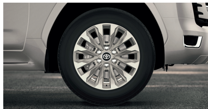
20" ALLOY WHEELS (ZX Exclusive)