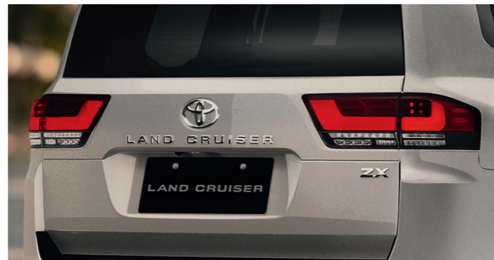
LED REAR Combination Lamps with Sequential Turn Signal (ZX Exclusive)