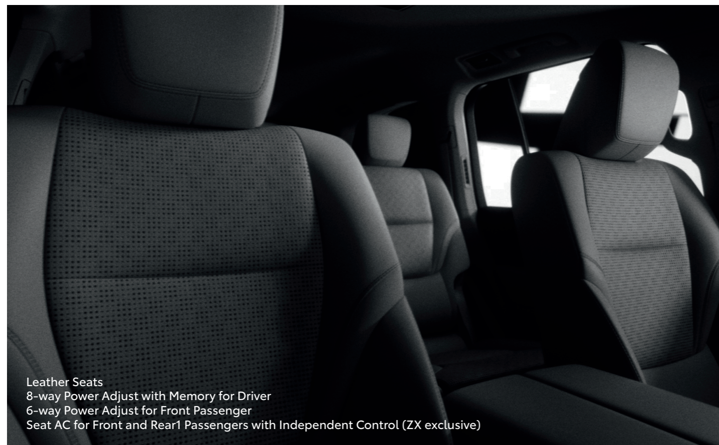
Leather Seats 8-way Power Adjust with Memory for Driver 6-way Power Adjust for Front Passenger Seat AC for Front and Rear1 Passengers with Independent Control (ZX exclusive)