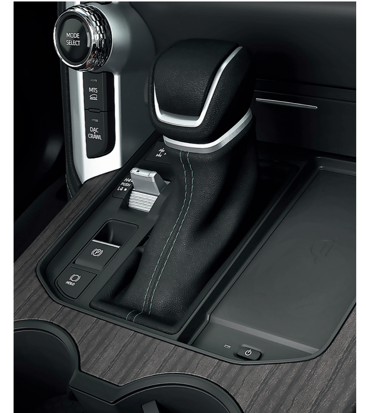
WIRELESS CHARGER (ZX Exclusive)