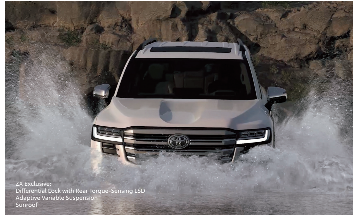
ZX Exclusive: Differential Lock with Rear Torque-Sensing LSD Adaptive Variable Suspension Sunroof

With power comes confidence. Promising to deliver remarkable performance and efficiency, the Land Cruiser is powered by a 3.3-liter twin-turbo V6 diesel to let you conquer both on-road and the toughest off-road environments. Every aspect of the Land Cruiser is designed, engineered, and built with quality in mind. This is the most powerful and capable Land Cruiser ever made.