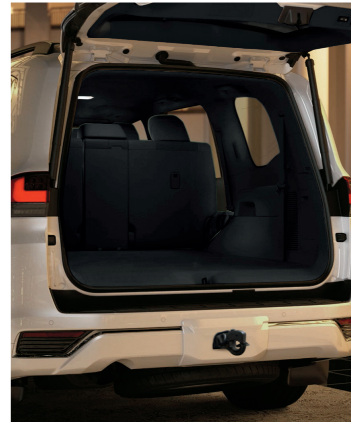
POWER BACK DOOR with Pre-Lock Function (ZX Exclusive) Power Recline/Fold 3rd Row Seats