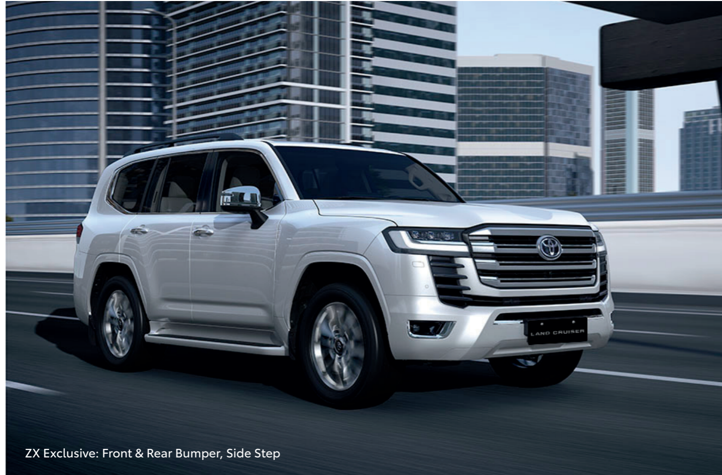
ZX Exclusive: Front & Rear Bumper, Side Step

The ultimate expression of luxury and capability, the Land Cruiser is ready to make an impression wherever you go. Sleeker and sturdier than ever, it is the perfect blend of strength and sophistication.