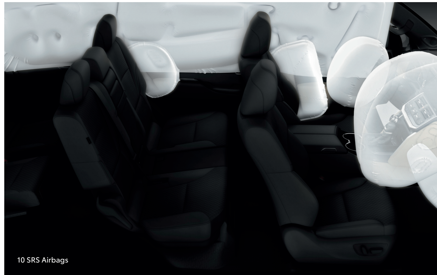
10 SRS Airbags