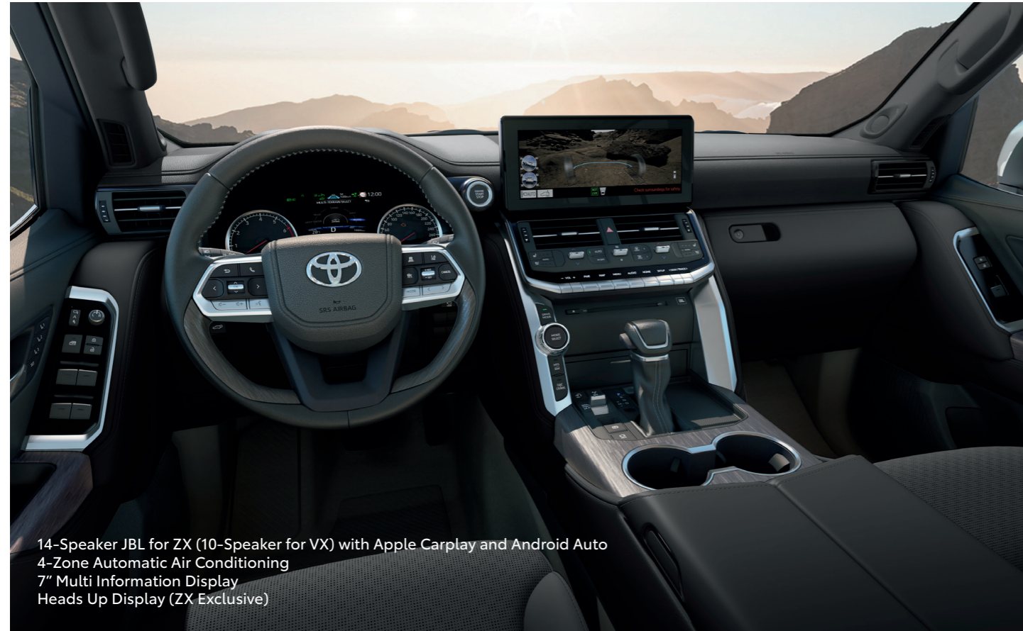
14-Speaker JBL for ZX (10-Speaker for VX) with Apple Carplay and Android Auto 4-Zone Automatic Air Conditioning 7" Multi Information Display Heads Up Display (ZX Exclusive)

Step into a world where comfort and style meet. The Land Cruiser is packed with intelligent and intuitive technology to make a sophisticated, comfortable environment fit for your lifestyle. From materials that raise its premium feel to ample cargo space that lets you bring more of what you need, get ready to take every trip to the next level.