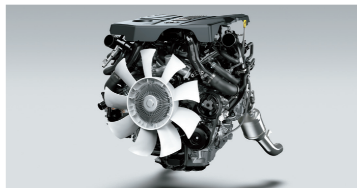
3.3L V6 TWIN-TURBO ENGINE with 306 Ps Max output and 700 Nm Max Torque