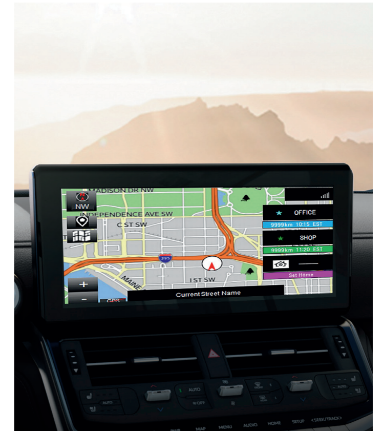
EMV & NAVIGATION SYSTEM