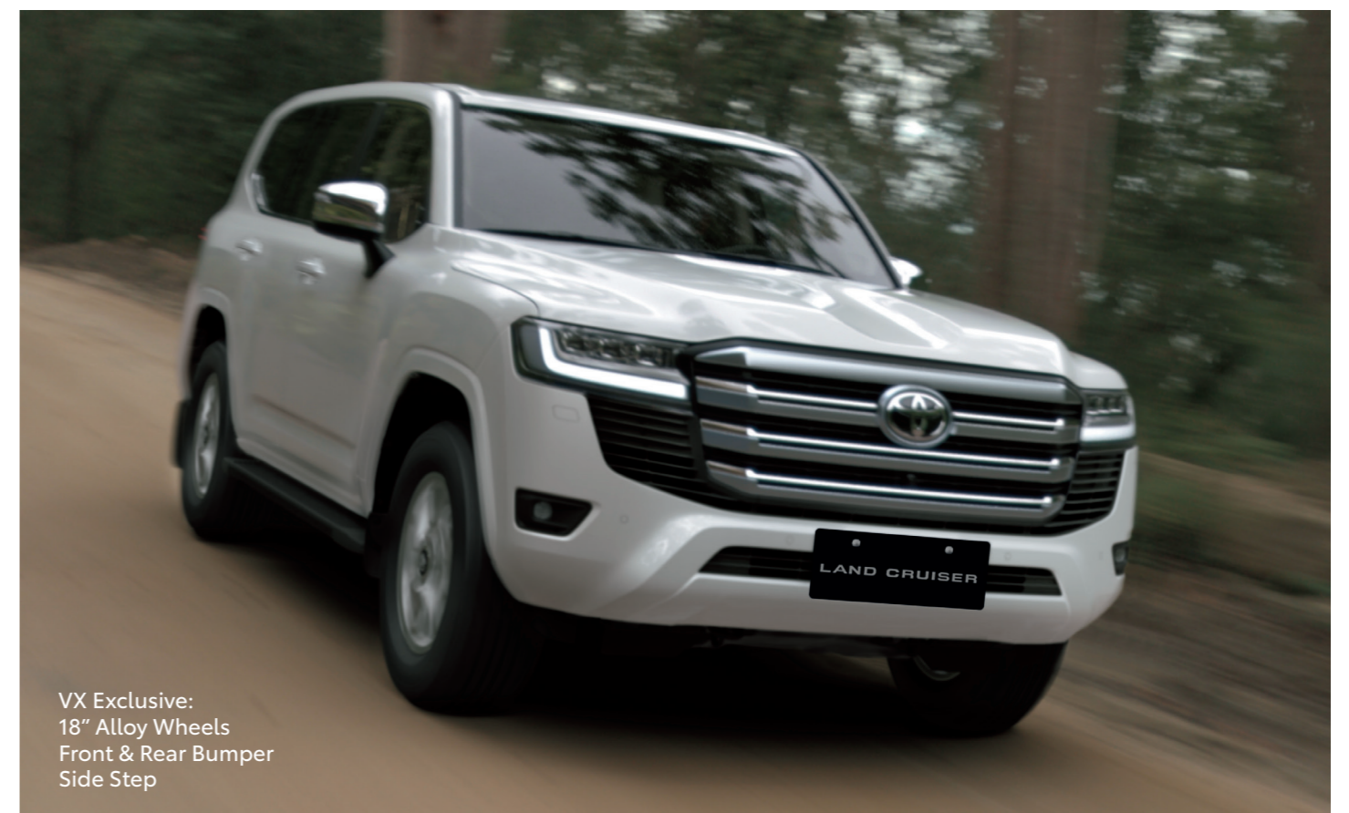
VX Exclusive: 18" Alloy Wheels Front & Rear Bumper Side Step