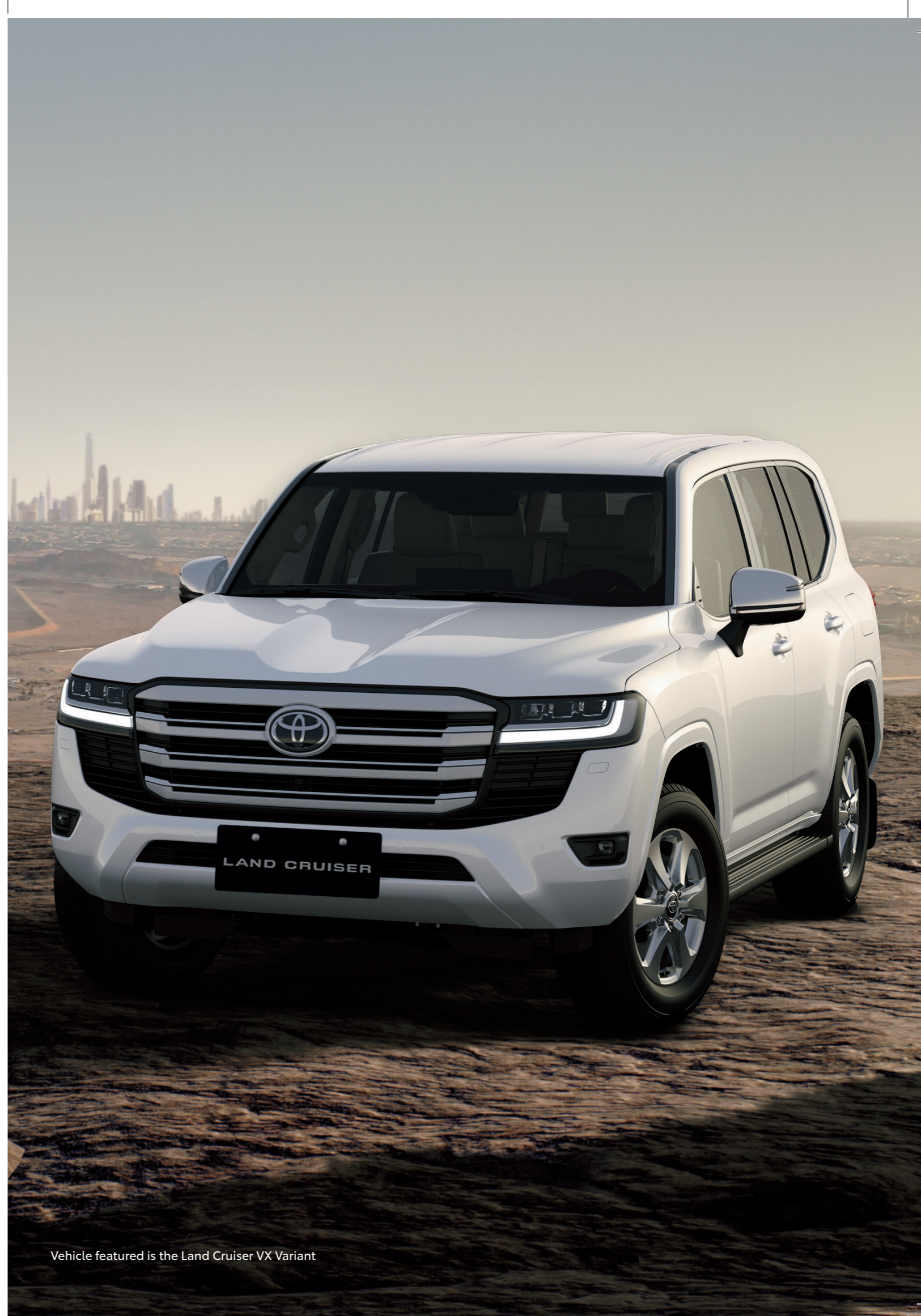
Vehicle featured is the Land Cruiser VX Variant