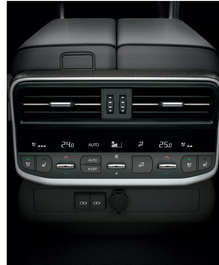
REAR SEAT AC (ZX Exclusive)

As the latest extension of the iconic badge, the Land Cruiser celebrates where it's been while continuing the tradition of luxurious comfort and convenience. So no matter where your journey takes you, the comforts of home can come along for the ride.