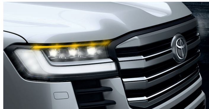
LED HEAD LAMPS with Sequential Turn Signal